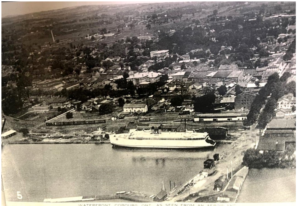
5 WATERFRONT COBOURG, ONT. AS SEEN FROM AN AEROPLANE