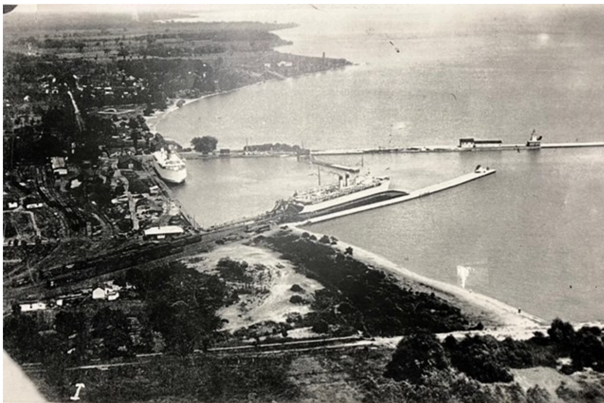
WATERFRONT, COBOURG, ONT., AS SEEN FROM AN AEROPLANE.