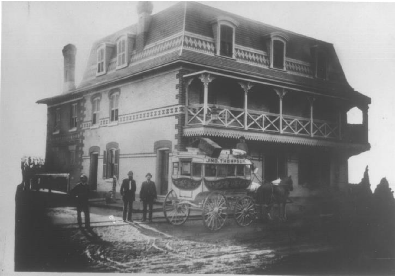
9005 Toronto-Richmond Hill Stage Coach. (Comm.) Dec. 5/31.