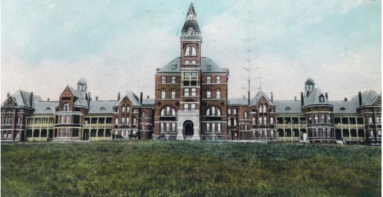
ASYLUM, ORILLIA, ONT., CANADA